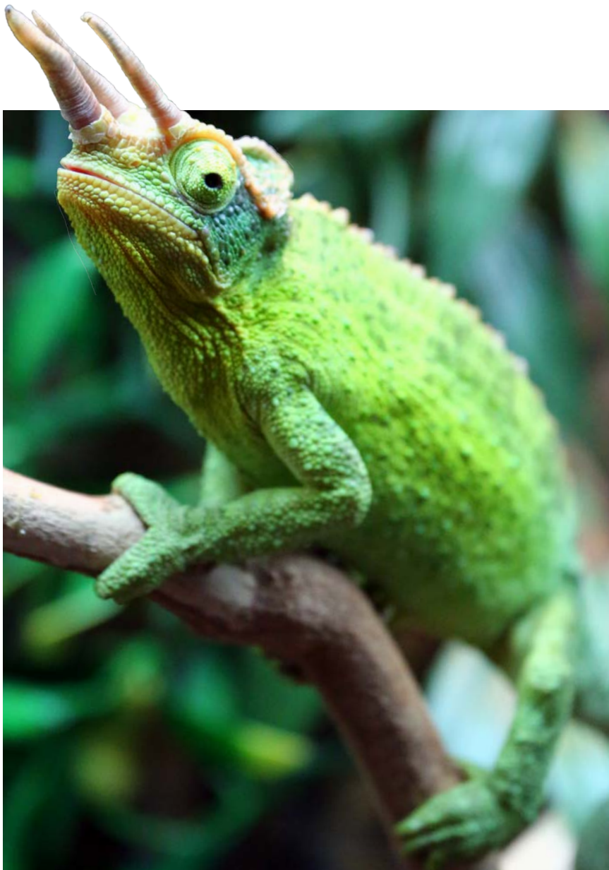
This lizard has little horns.