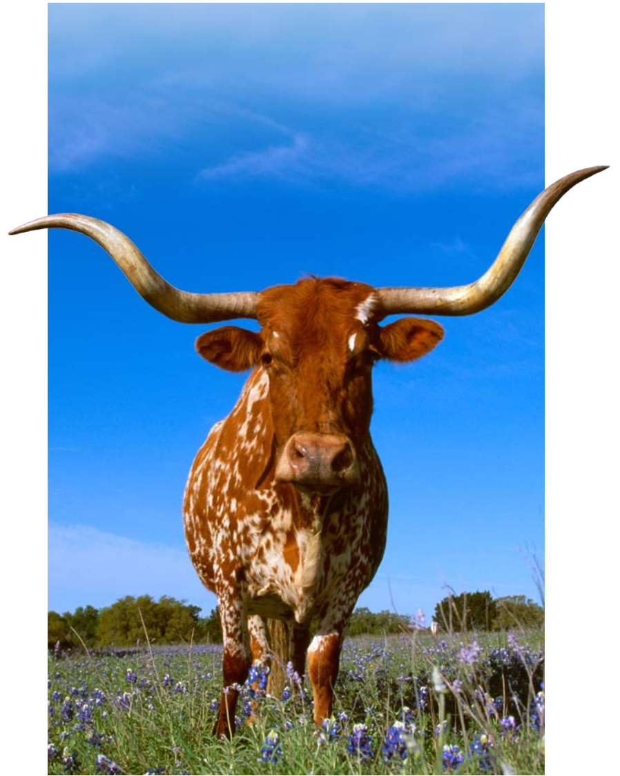
This bull has long horns.