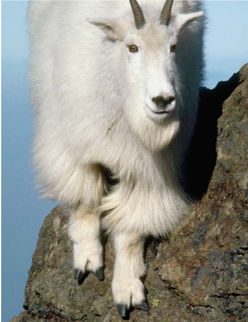
This mountain goat has short horns.