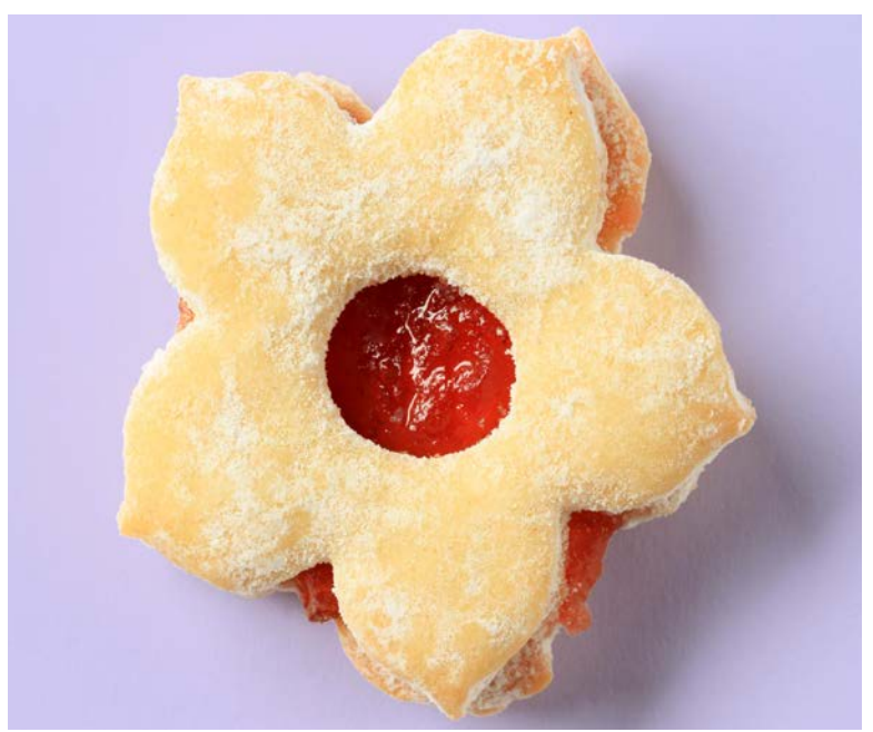
Make flower cookies.