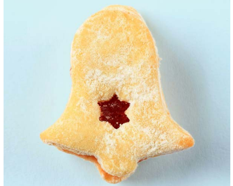
Make bell cookies.