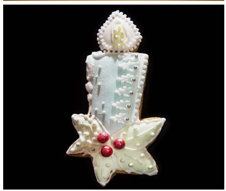
Make candle cookies.