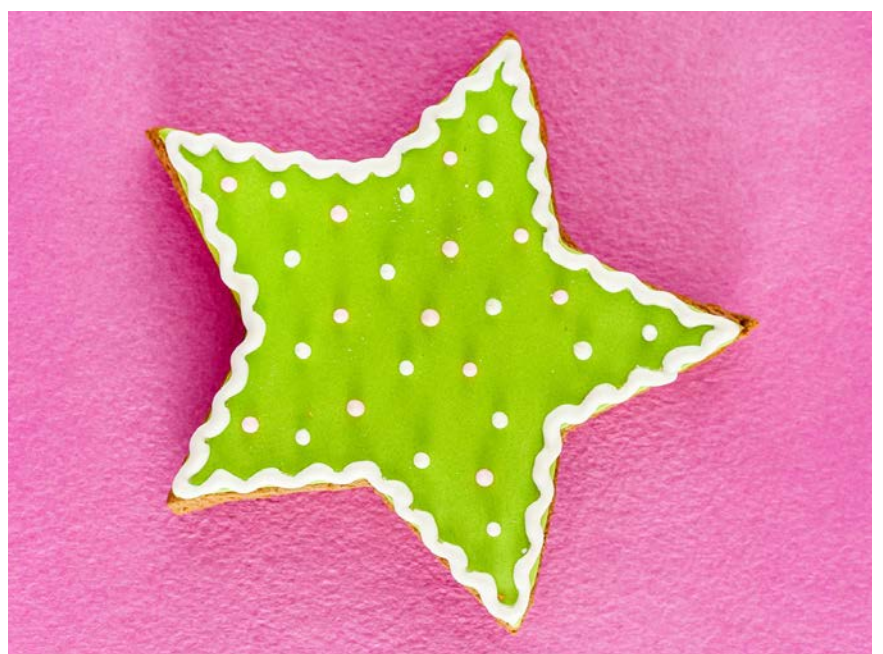
Make star cookies.