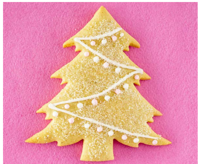
Make tree cookies.