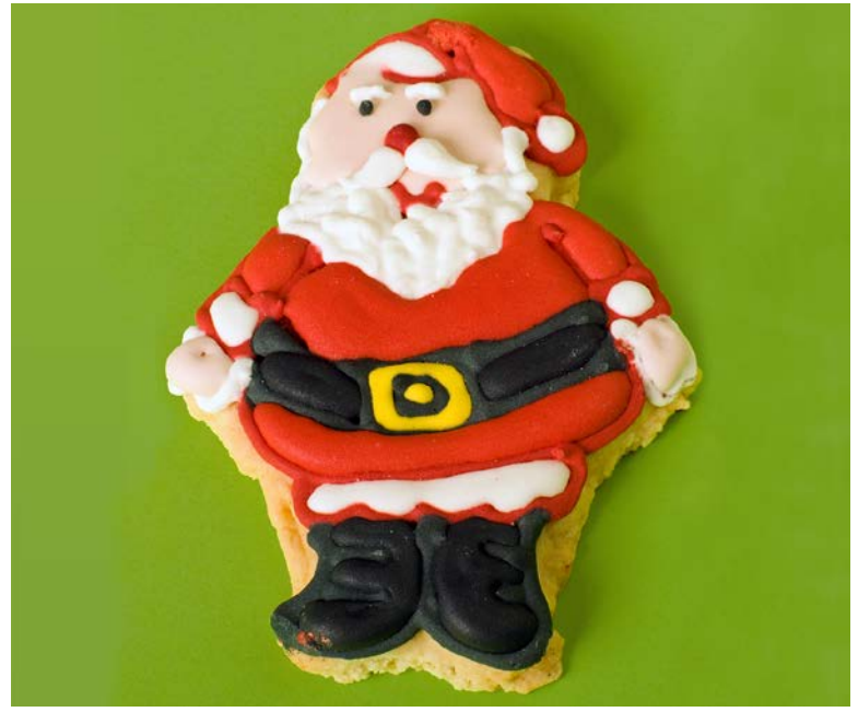
Make Santa cookies!