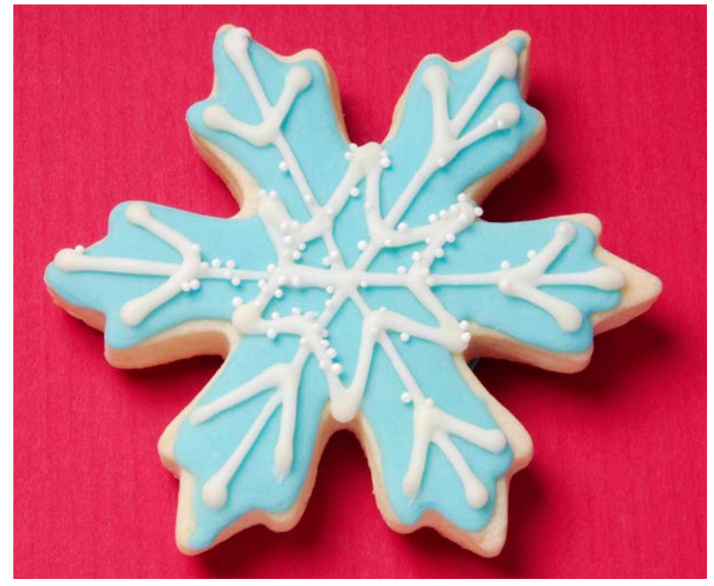
Make snowflake cookies.