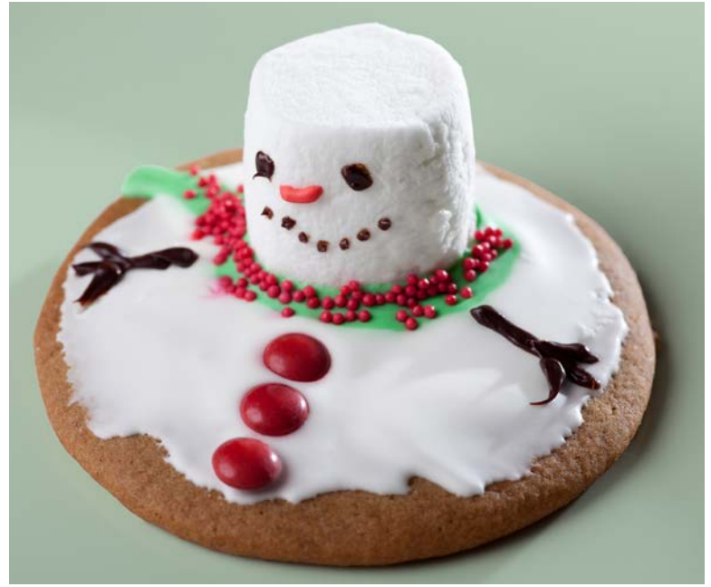
Make snowman cookies.