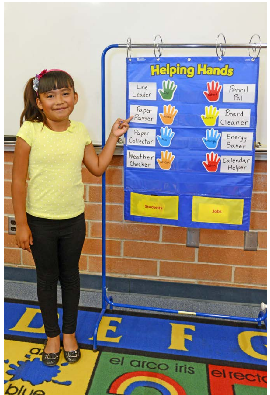
The job I do is paper passer.