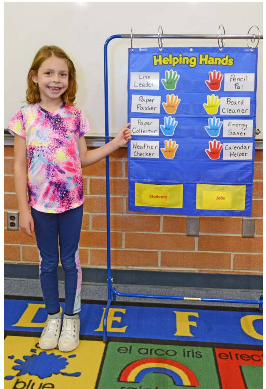
The job I do is paper collector.