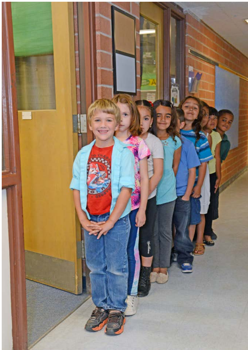
As line leader, my job is to go first.