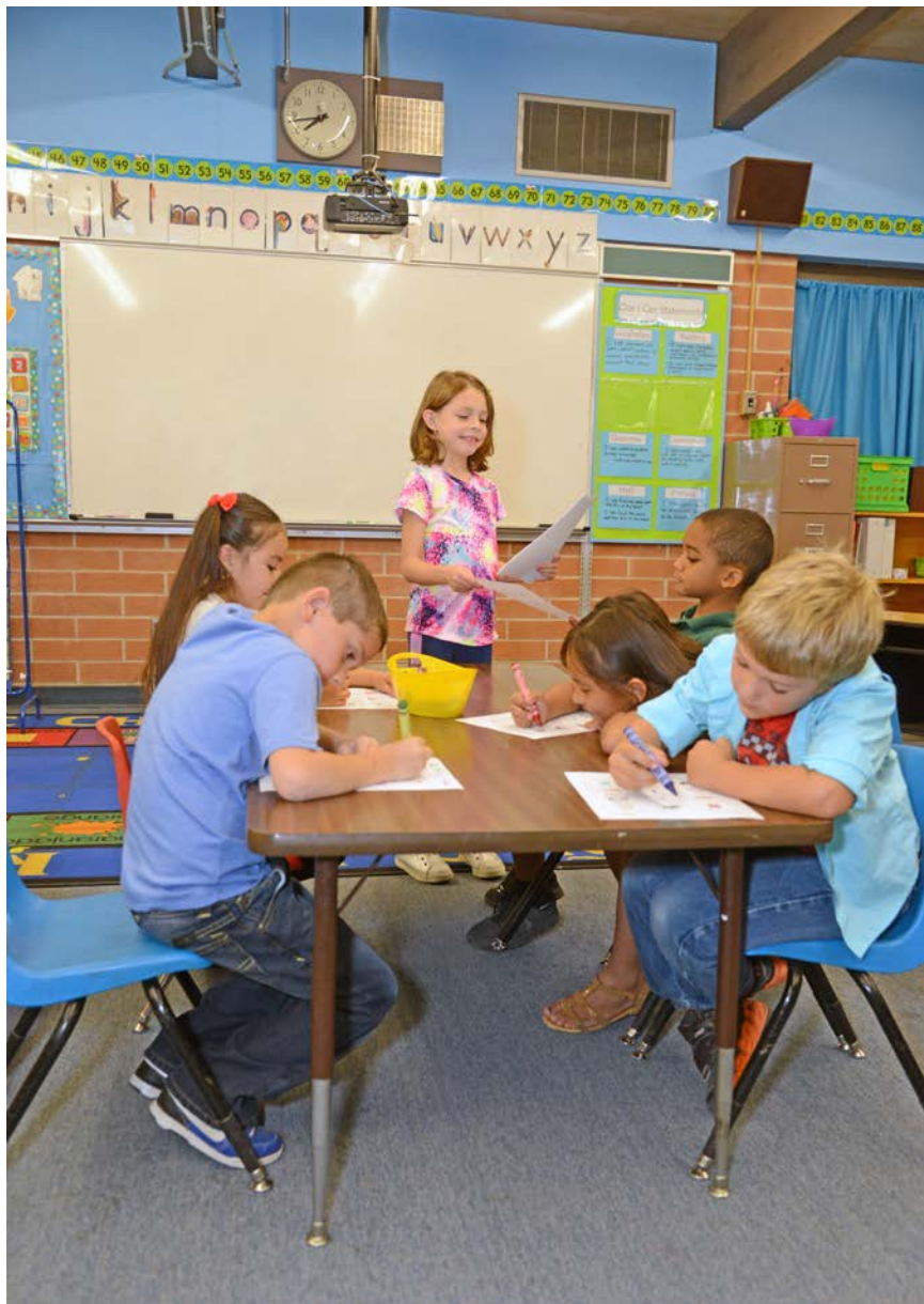
As paper collector, my job is to collect papers.