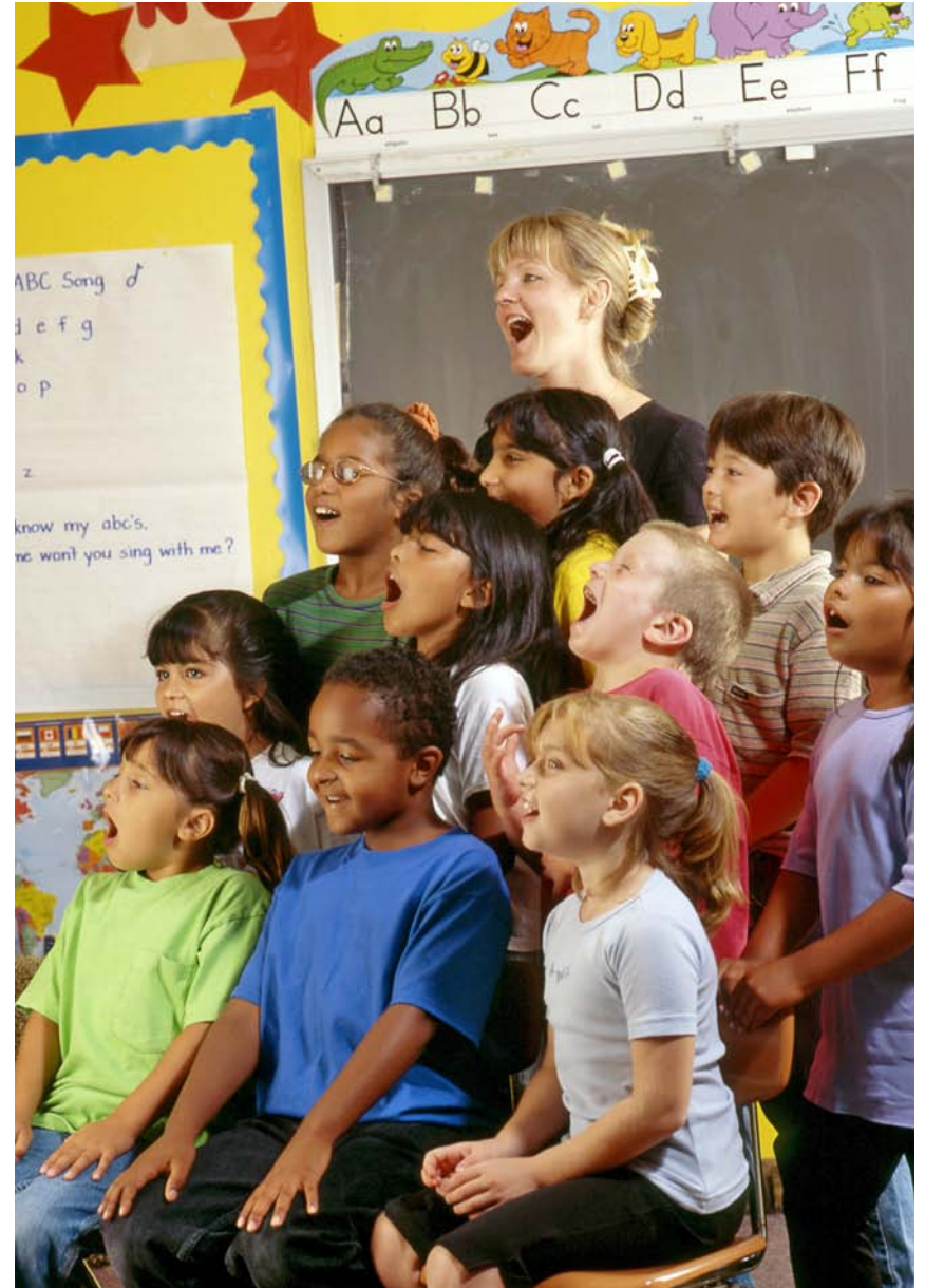
They sing a song.