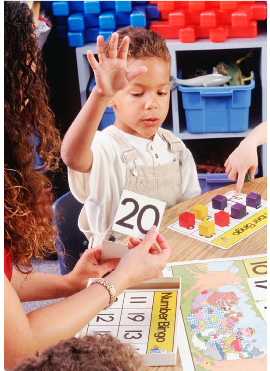
They count numbers.