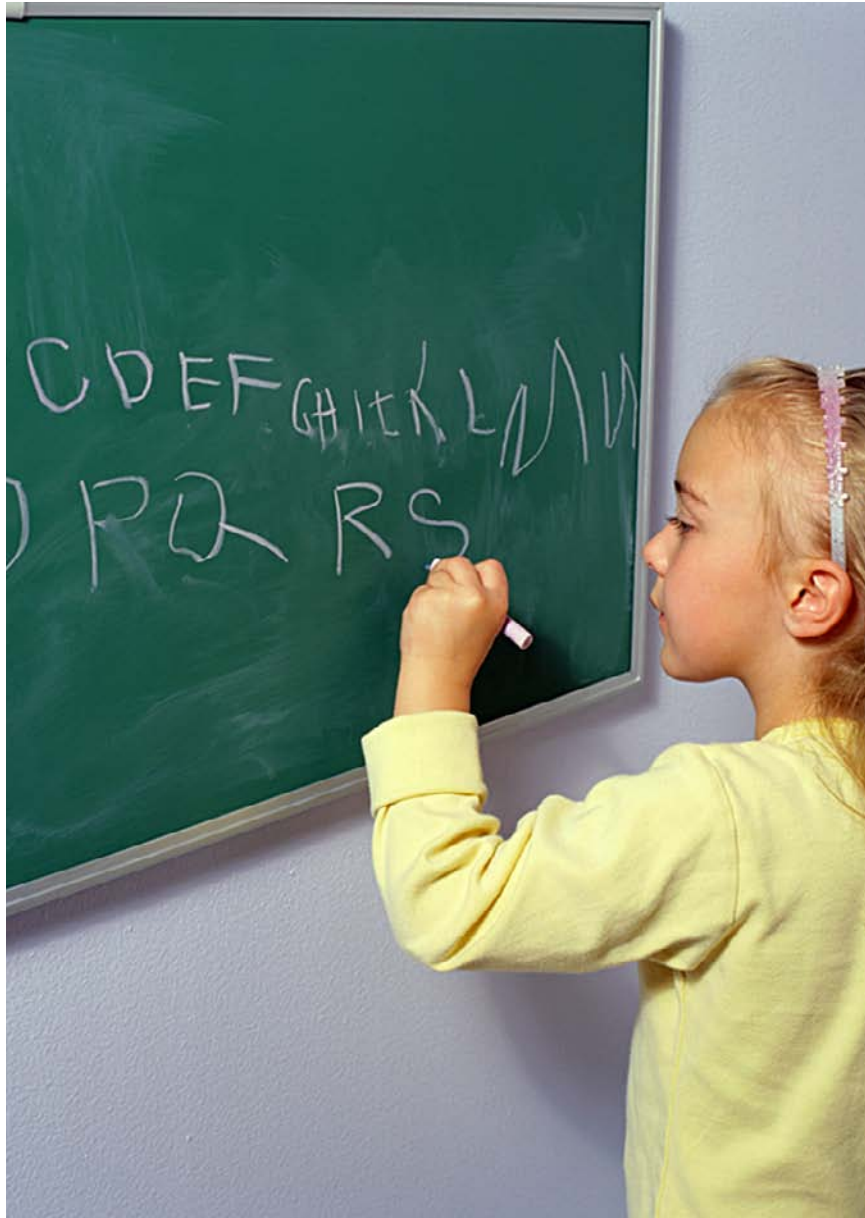
They write the ABCs.