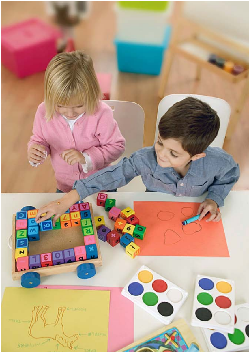
They share toys.