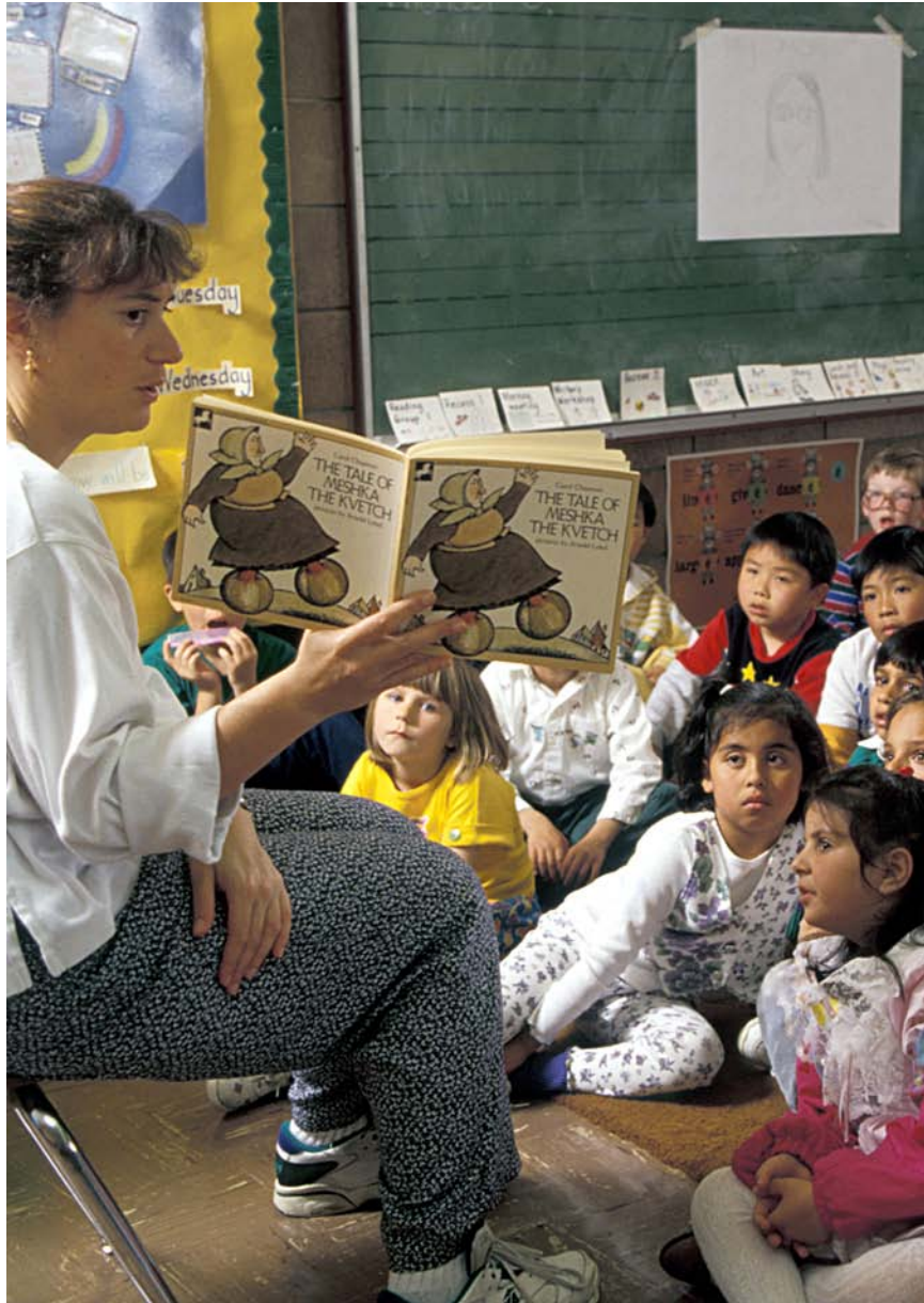
They listen to a story.