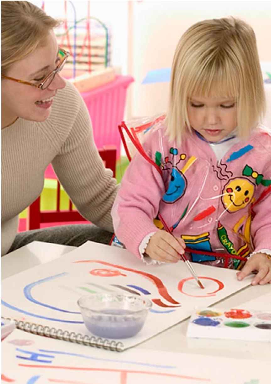
They paint a picture.