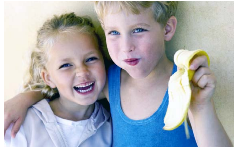
They eat snacks.