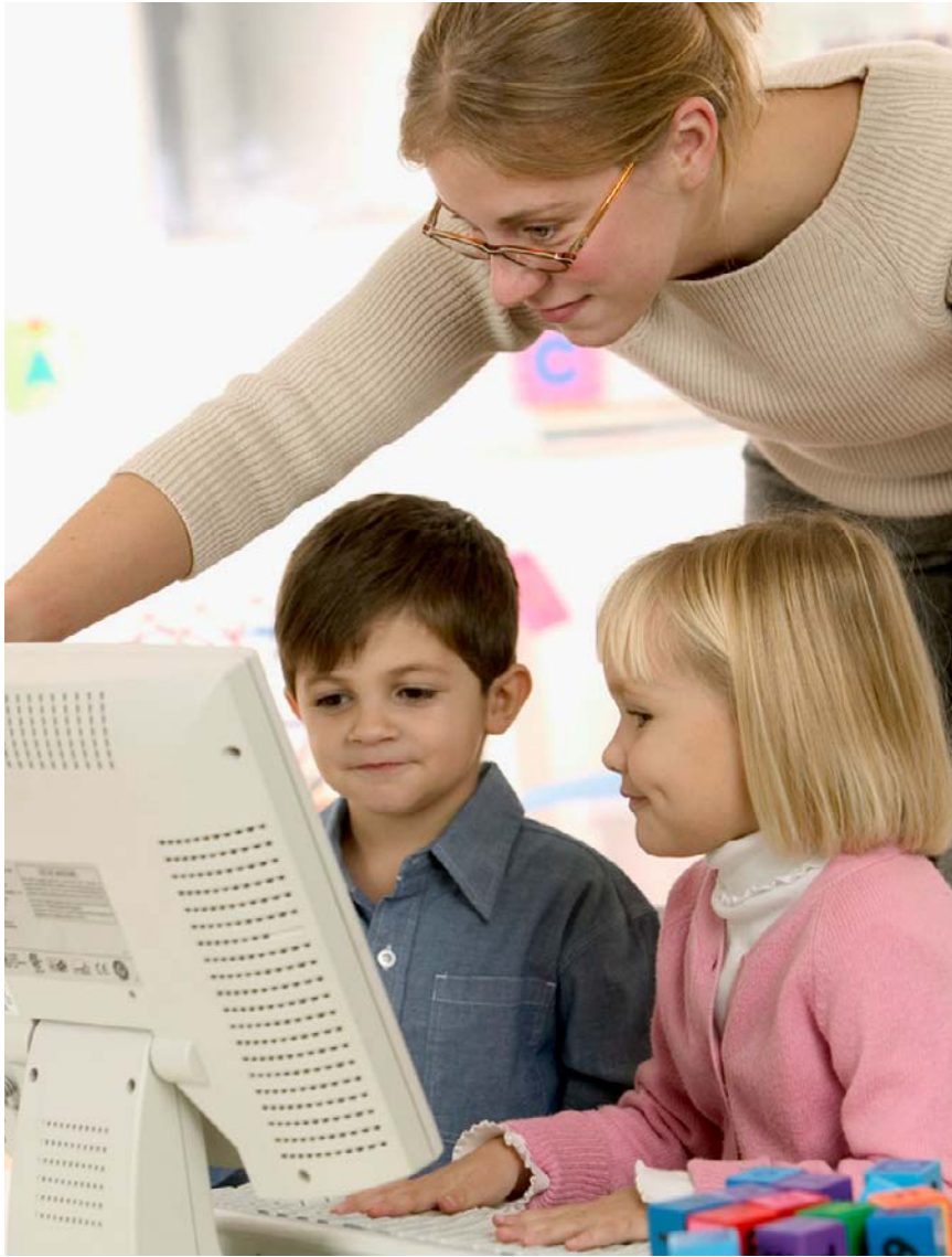
The children are busy at school.